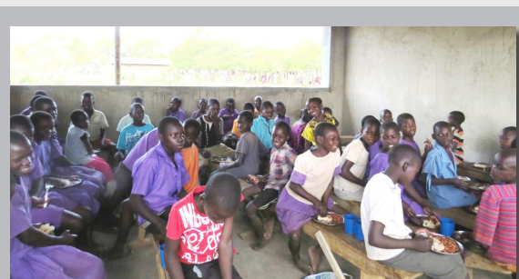
Students enjoying a nutritious noon meal.

Last December, Living Waters made an appeal for the Missionaries of St. Francis de Sales (MSFS) FOSTER Program (Fransaliam Organization for Social Transformation, Education & Renewal). One of the goals of this program is to provide for the basic needs of orphaned children. Many children were not going home from school for their midday meal because there's no one there to give them food. Thankfully, there was a generous response and donor money was used to buy food grains and a water tank for gathering rainwater.